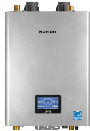
Wall Hung Design featuring Top and Bottom Water Connections - Compatible with 3" PVC Vent