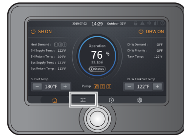
Large Color LCD Front Panel with Advanced Hydronic Operation and Temperature and Status Display