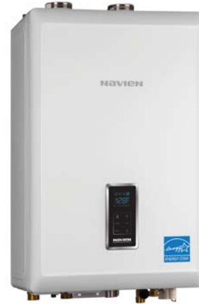
Sleek Design - Compatible with 2" PVC Vent