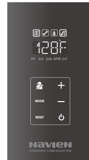
INCLUDED Illuminated Front Panel with Advanced Hydronic and DHW Operation